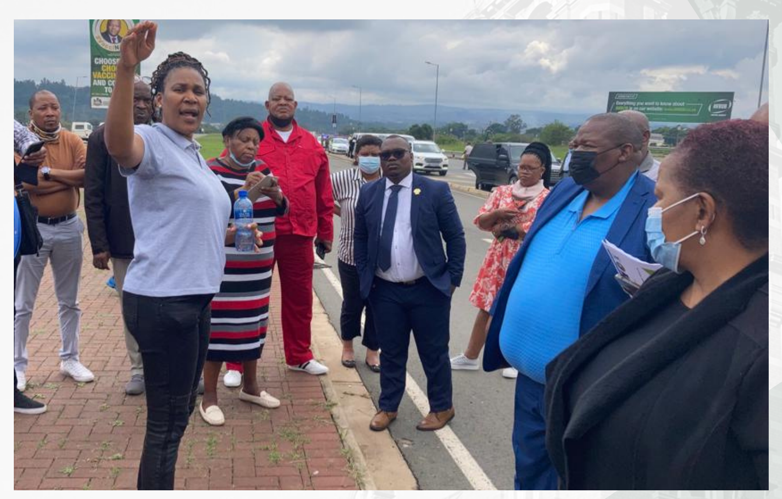
Above: The inspection was also done on Moses Mabhida Road