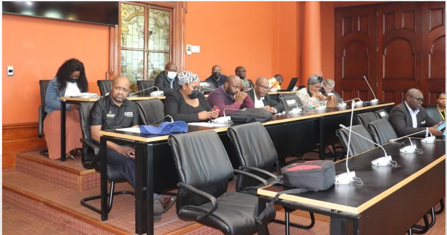
Above: Discussion before the mop-up operation