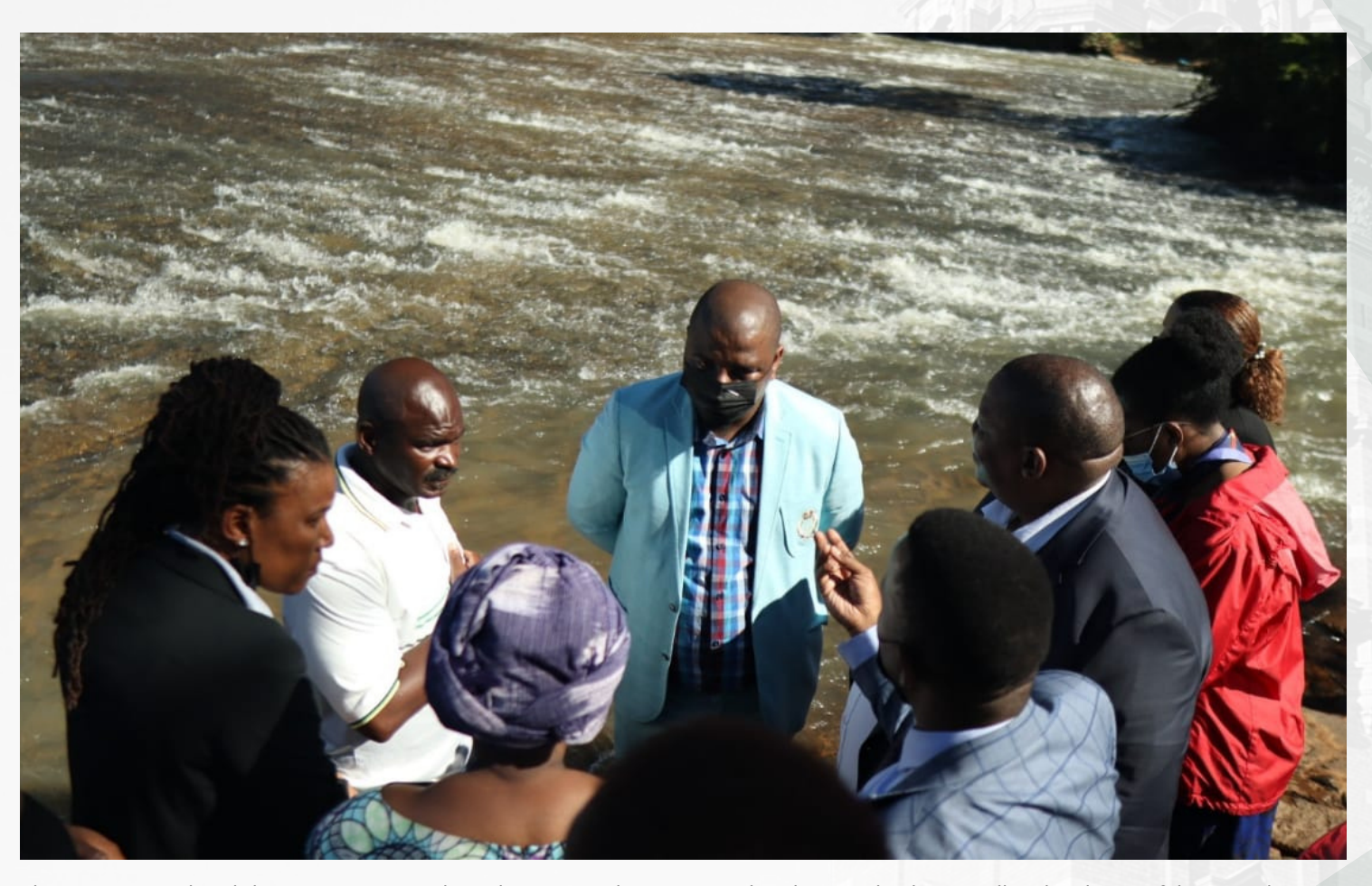
The Minister outlined the government's plans that are in place to provide adequate bridges to allow locals to safely cross the river in the future as well as temporary housing arrangements for those who suffered losses during the floods.