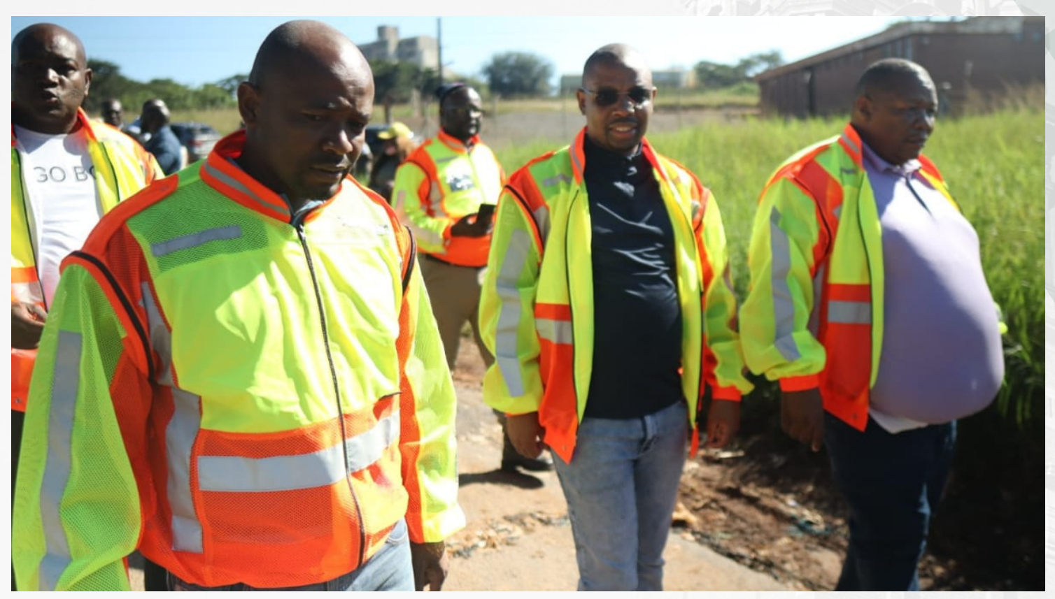
Above: Deputy Mayor Mxolisi Mkhize, MEC Kwazi Mshengu and Mayor Cllr Mzi Thebolla