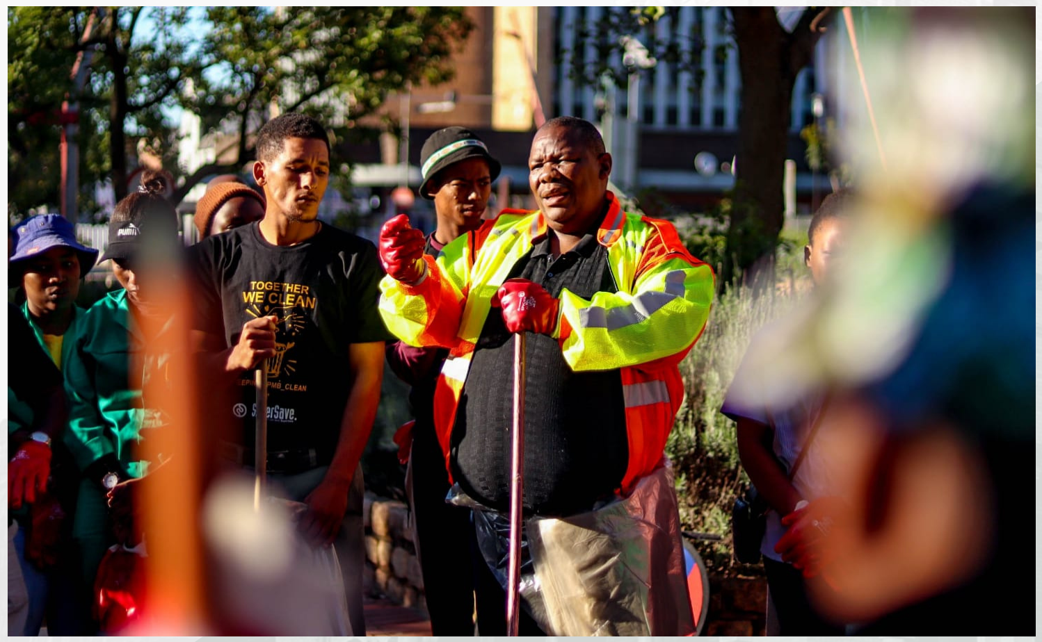
Above: Mayor Thebolla encouraged residents to work together in maintaining cleanliness of the city