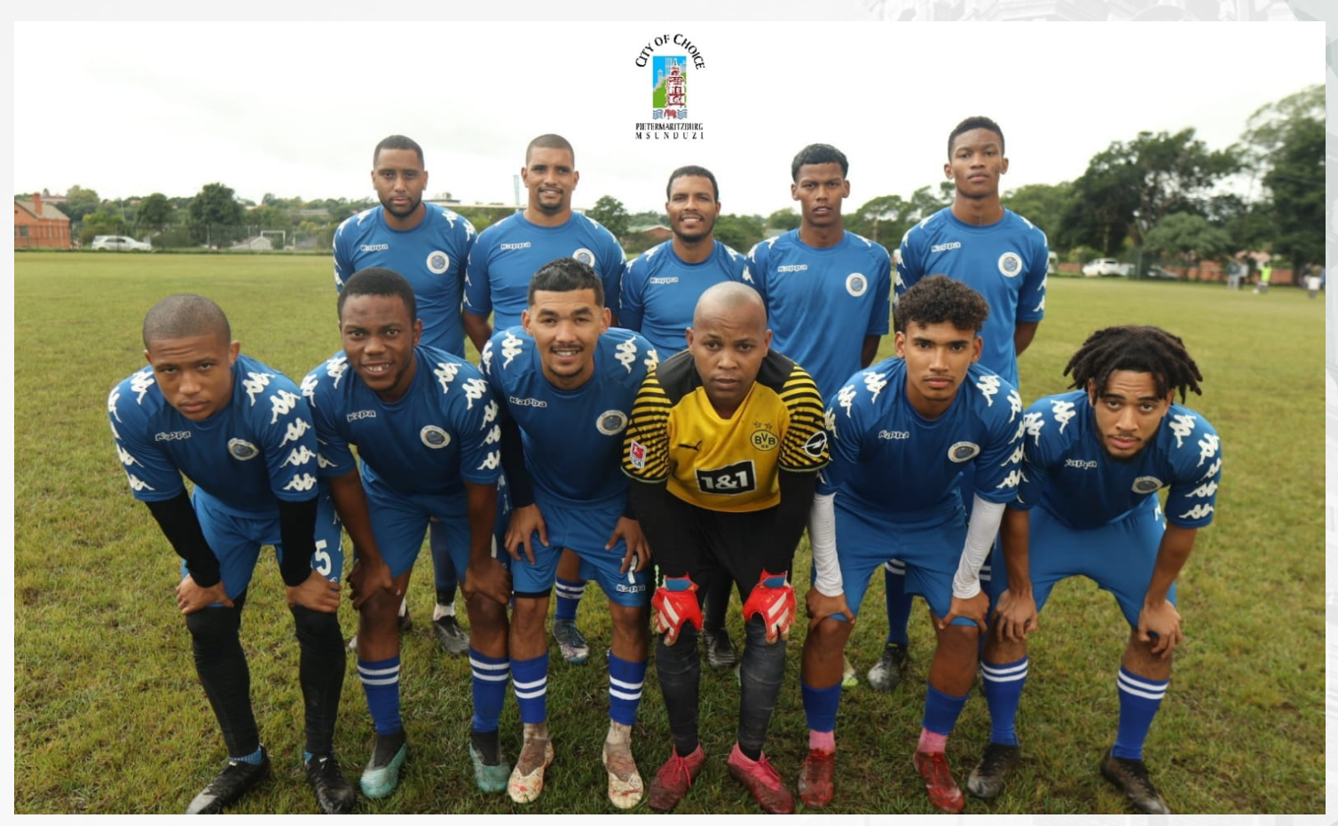
Above: Eight teams participated in the Msunduzi Easter Tournament which took place at AB Jackson sports ground